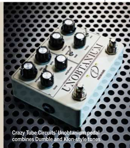
Crazy Tube Circuits' Unobtanium pedal combines Dumble and Klon-style tones

If this style of pedal appeals but you're looking for different flavours, Crazy Tube Circuits also bundles Dumble and Klon sounds together in the Unobtanium (£249), while its Crossfire (£189) pairs Fender 'black-panel' sound with Tube Screamer drive. For a Hiwatt-style pedal, check out the Menatone MenaWatt v.III ($209), although you may have to import it from the USA. Macaris does modern recreations of the Colorsound Power Boost (£359) and Overdriver (£329). Also check out the Tru-Fi Colordriver (£199), Electronic Orange Bananaboo (£224) and, if you fancy building one yourself, Aion FX has the Nucleus Vintage Boost printed circuit board ($12.50) but may produce a full kit if enough people are interested.